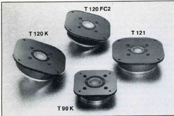
T 120 K : 120 mm, kevlar, 22 kHz, 93 dB