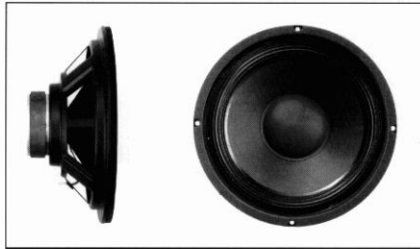
RESPONSE CURVE refer to page 16

Utilisation 2 ou 3 voies Cône papier Suspension corruguée papier Bobine haute température Châssis acier embouti